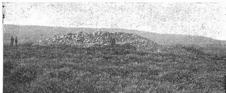
CAIRN OF KILLARAGH—GENERAL VIEW.

bourhood of the present town of Ballyconnell. The town receives its name from this tradition: \text{DÉAL ÁTA CONAILL} , i.e., the ford-mouth of Conall. The actual ford is pointed out, traditionally, a short distance north of the present bridge at Ballyconnell. O'Donovan's statement, that the present bridge crosses at the actual ford, does not now receive local sanction.