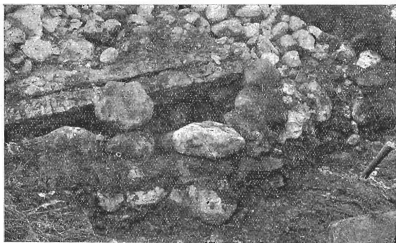
VIEW OF TOMB FROM OUTSIDE.

We have, therefore, both historical and traditional evidence concerning the place of Conal's death; but of his burialplace we have only the tradition. Relying on this tradition of the Ballyheady cairn, some people have hastily inferred—and the inference seemed at first not unreasonable—that the remains