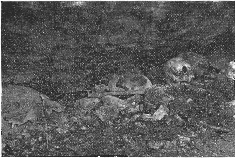
INTERIOR OF TOMB.